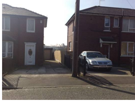
37 Longhill (property to the right) Front and rear fencing with side gate.

The following photographs are of some of the environmental works carried out on the estate.