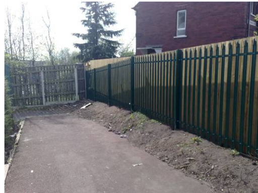
Footpath from Cheltenham Street