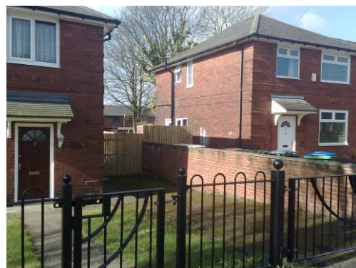
2 Worcester Street. Fencing front and back, and side divider fencing and gate