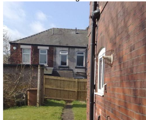
34 Bosworth Square. Rear garden fencing