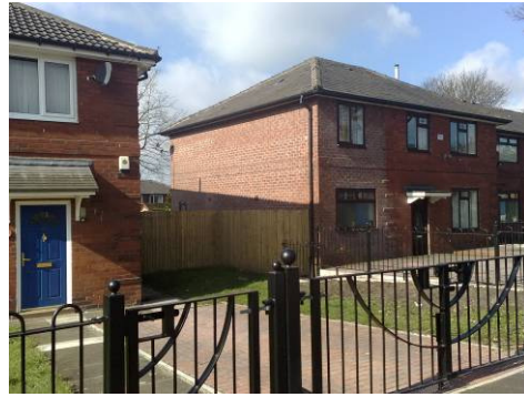
10 Worcester Street, Driveway, front and rear fencing, side divider