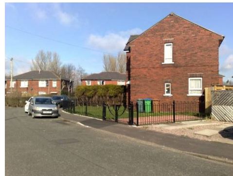
16 Longhill. Front, rear and side fencing, driveway