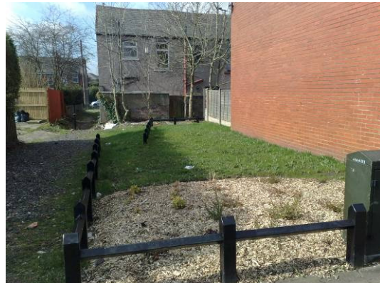
Demolition site – Bosworth Street