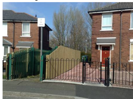
16 Rufford Avenue Front fencing, driveway and side fencing to provide privacy and security from public footpath