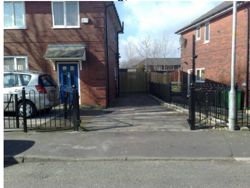
18 Worcester Street, Front, rear and side divider fencing