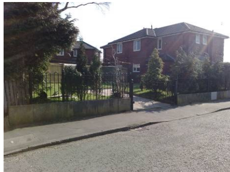
6 Ribble Street. Front fencing