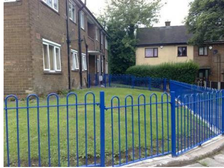
Fencing at 81-87 Longridge Drive