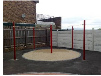
66-76 Whalley Road courtyard

The next courtyard had been resurfaced at the beginning of the NDC scheme, and had moss growing, and the brick work was grubby. ESG agreed to include in the refurbishment, to bring it back up to the standard of the others. It was power washed by the contractors whilst on the estate.