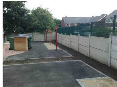
73-87 Whalley Road courtyard