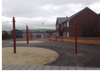
2-4 Dilworth Close/ 20-44 Downham Road courtyard