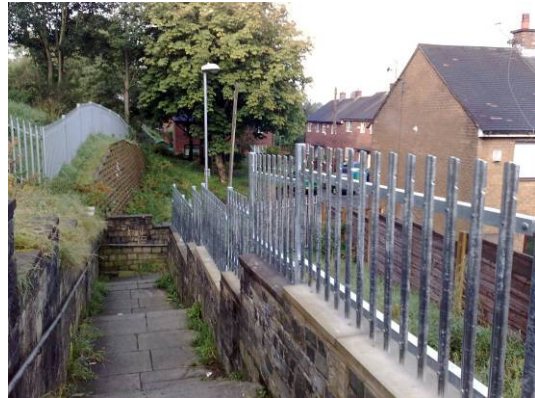
Fence at the steps Chatburn Gardens/Dilworth Close