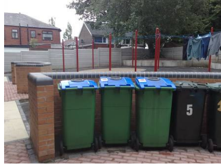
Before and after photos of the typical bin stores in the courtyards