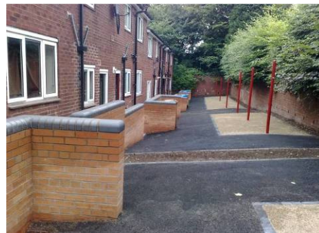
53-71 Whalley Road courtyard