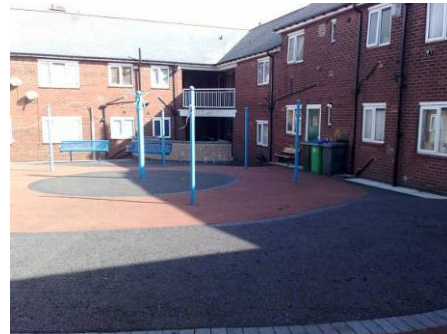
Downham Road/Heady Hill Road/Whalley Road courtyard

The following photographs are of the environmental improvements carried out