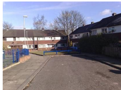
Knee rail fitted at Sabden Close to prevent people driving across it.